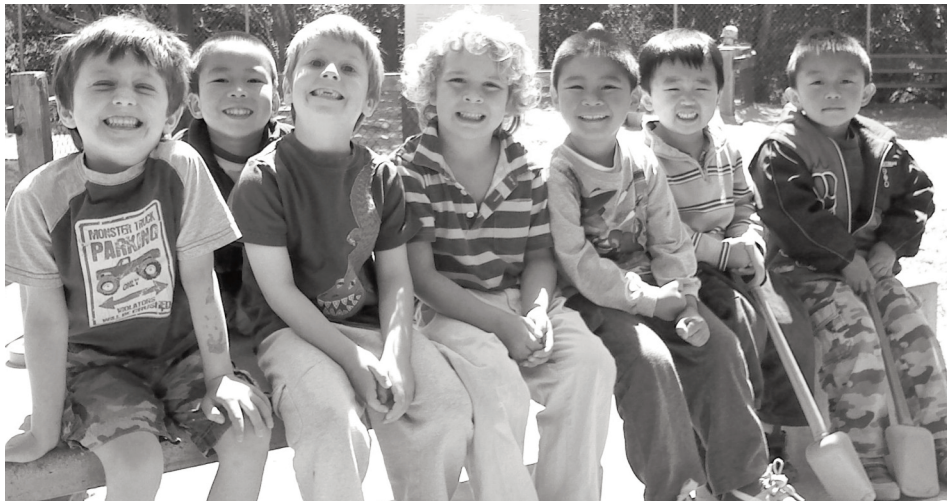
Laughter is in the curriculum at the Rec's preschool program.