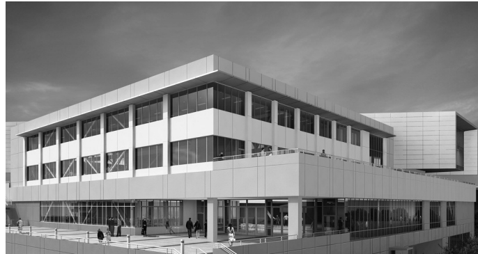
artist's rendering of the new College Center

I invite you to visit the campus and see for yourself the vibrant col